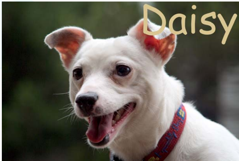
2005 – 2006 Bark Ranger

Thank you for your support from your friends at the MVH Pet & Wildlife Fund